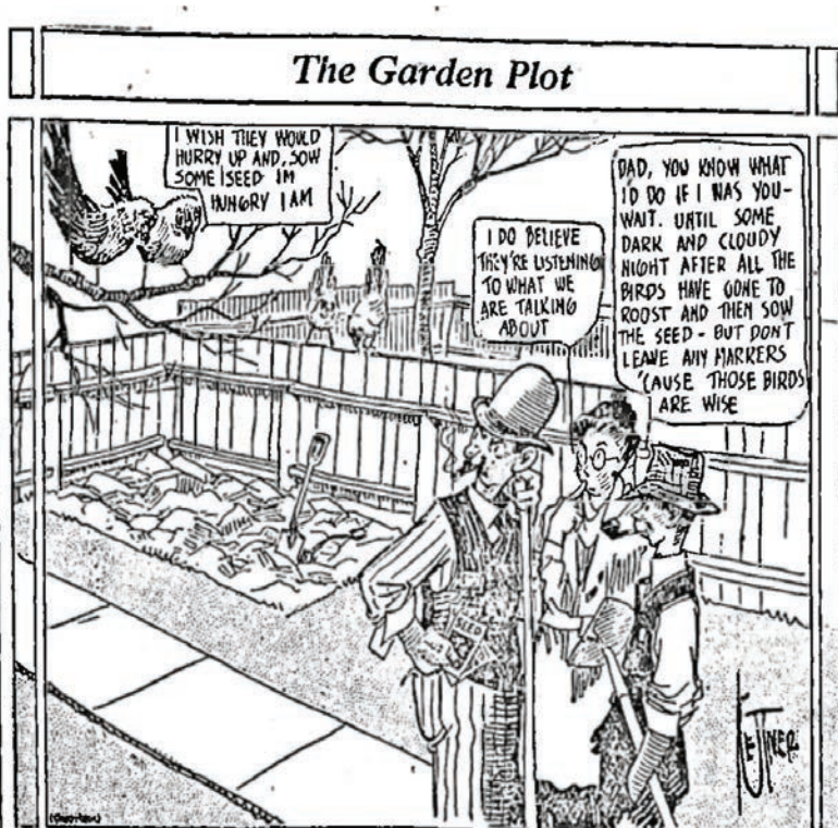
"The Garden Plot" The Huron Valley Sentinel (Flat Rock), 1 April 1921, p. 1.

Vintage Cartoons from the Hometown Paper